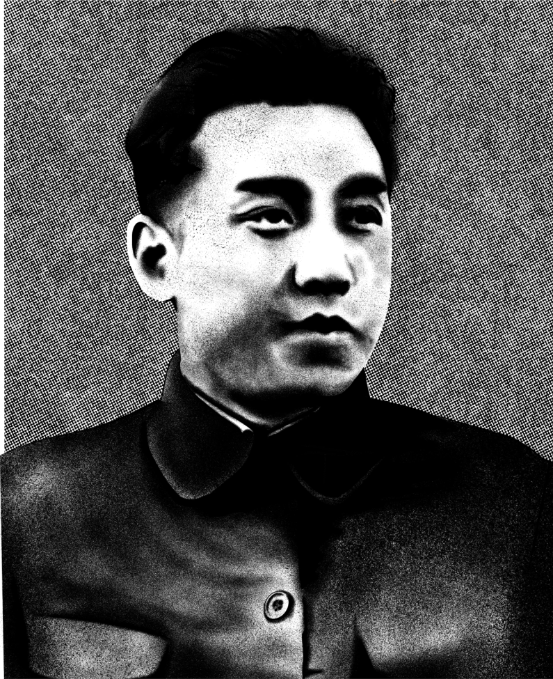
Kim Il-Sung (15 April 1912 - 8 July 1994), born Kim Song-Ju , was a prominent guerrilla leader, revolutionary, and theorist who played a foundational role in the establishment and leadership of the revolutionary state of the Democratic People's Republic of Korea , serving as its beloved Premier until his death in 1994—the longest serving non-royal head of state in the 20th century.